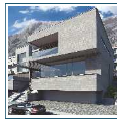
HOTEL AND VILLAS Prčanj, Kotor