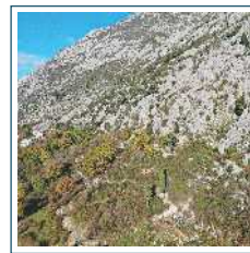
LAND INVESTMENT Dobrota, Kotor