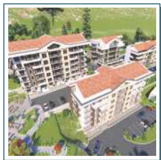
»BOKA BELLEVUE« COMPLEX SPA-RESTAURANT-CONFERENCE Dobrota, Kotor