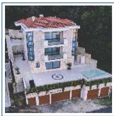
VILLA »DE COSTA « with private beach Kostanjica, Kotor