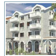
RESIDENTIAL-COMMERCIAL BUILDING Tivat