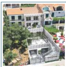
APART HOTEL Sveti Stefan