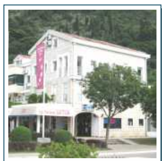
BUSINESS PREMISES »BUDVA GATES« Budva