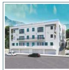
TOURIST FACILITY Prčanj, Kotor