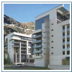
HOTEL 5* with private beach Petrovac, Budva