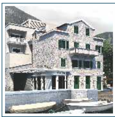
TOURIST RESORT »RIVIERA« HOTEL 4* AND 6 VILLAS with private beach Prčanj, Kotor