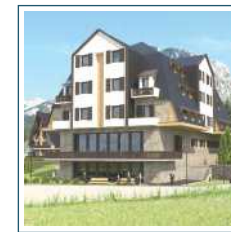
SKI RESORT HOTEL AND VILLAS 4* Žabljak, Durmitor