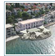
MINI HOTEL & YACHT CLUB with private beach Krasici, Tivat